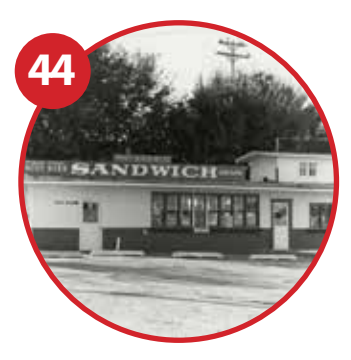
Maid-Rite: 100 years without many changes By Ed Wojcicki